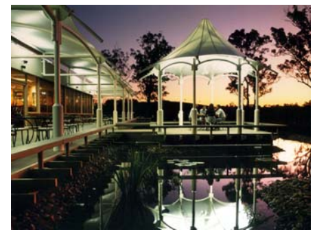
1. Picture Caption